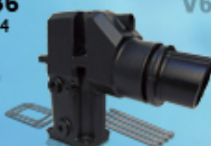
Volvo Penta - V6 - (2007 & Up)