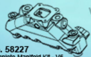
No. 58227 Complete Manifold Kit - V6