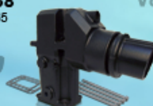
Volvo Penta - V8 - (2007 & Up)