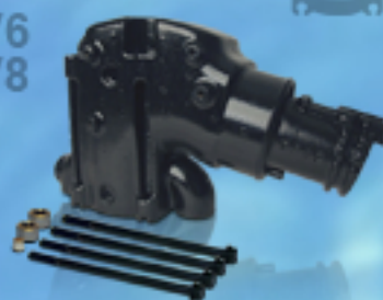
14° Riser, V6 & V8