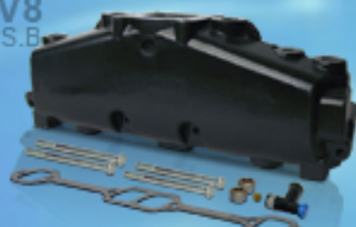
5.0/5.7L, V8 S.B.