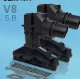
GM V8 305/350 CID (2007 & Up)