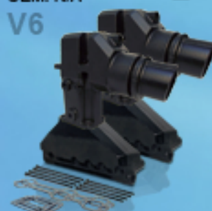
GM V6 262 CID (2007 & Up)