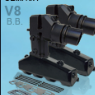
GM V8 454/502 CID (2007 & Up)