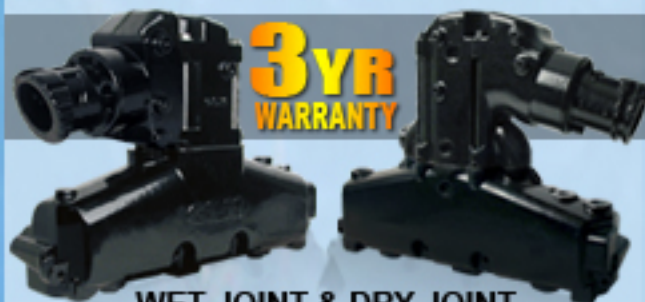
WET JOINT & DRY JOINT